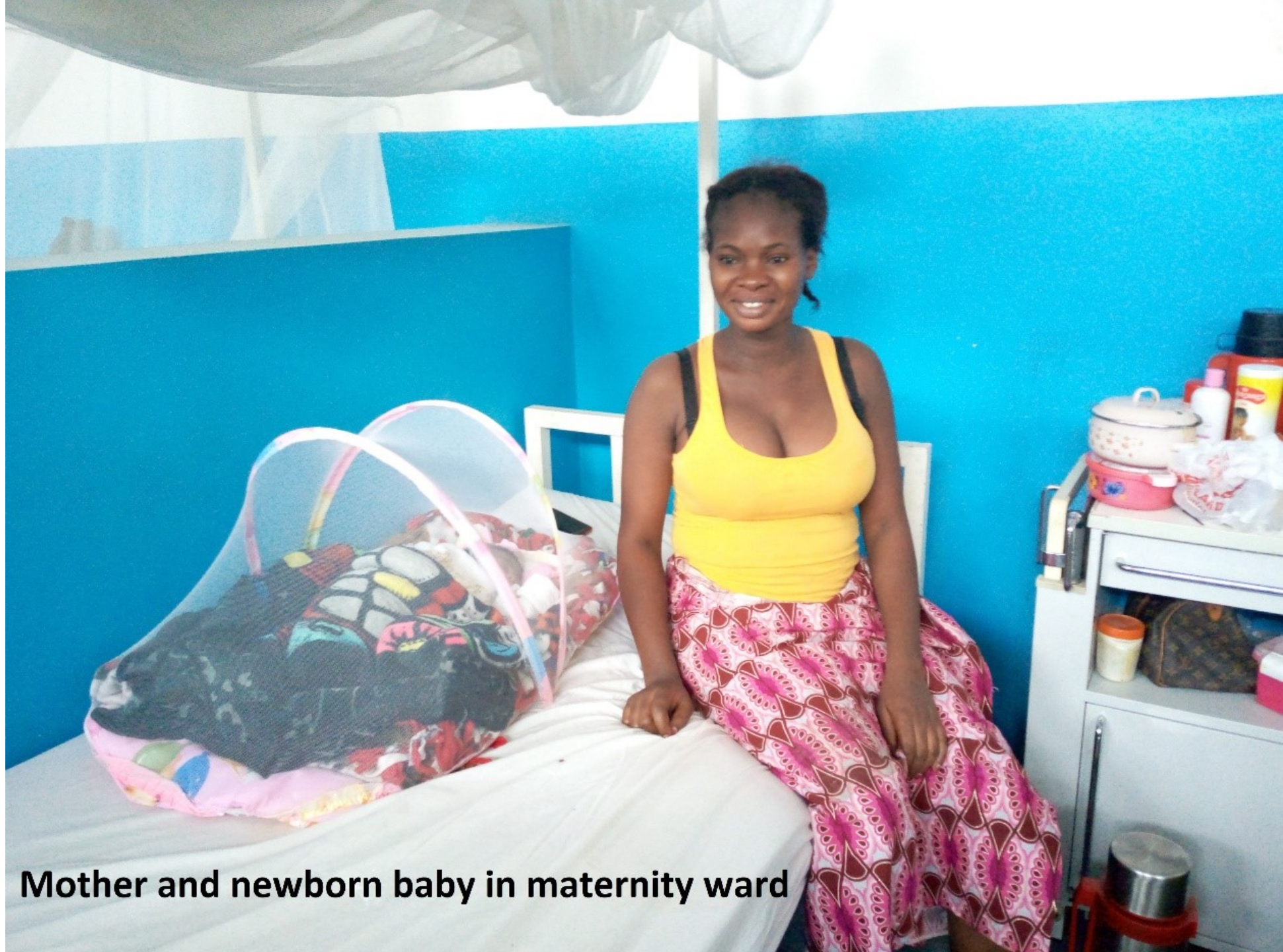
Mother and newborn baby in maternity ward