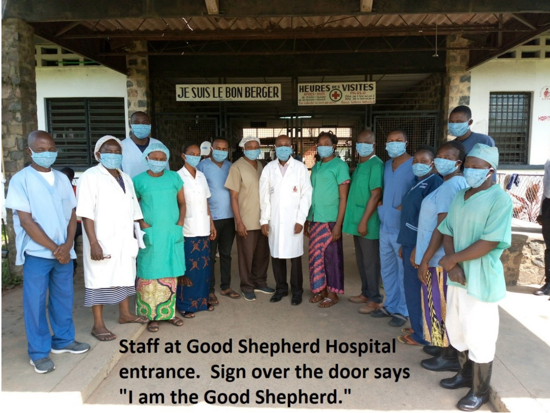
Staff at Good Shepherd Hospital entrance. Sign over the door says "I am the Good Shepherd."